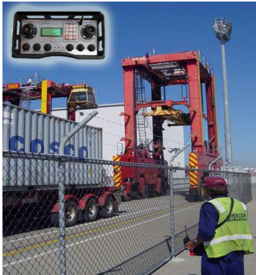
Figure 1 Container terminal operations

As such, precise GNSS is used to capture locality data, referenced to a regularly updated site locality plan, at the detachment/loading points from the straddle. This information is then linked to an overall management system, which when imposed with certain site constraints, will effectively position every container its content, mass and other useful information as it is moved through the transportation process.