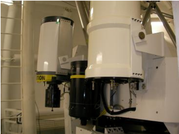
Figure 3. Cameras of Optical Telescope, photographed at Mt. Stromlo Observatory

shots of space, these snap shots are overlaid by using stars as fixed points which will show debris which are moving at a different rate (AFSPC, 2003). Figure 3 illustrates a photograph of the cameras mounted on an Optical and Laser ranging telescope in Mt. Stromlo, inside Observatory of Electro-Optics Systems, Canberra, Australia.